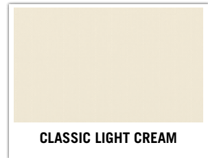
CLASSIC LIGHT CREAM

Nylite 90 / Maxilite 150 Against special order