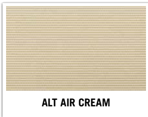
ALT AIR CREAM

Fibercon AP: 4.0 / 5.38 / 6.38 / 7.38 / 8.38 9.38 / 10.38 / 12.38 / 15.38