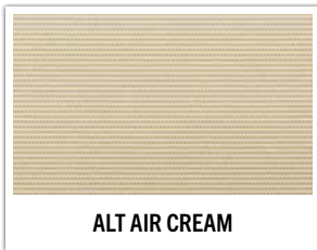
ALT AIR CREAM

Fibercon AP: 4.0 / 5.38 / 6.38 / 7.38 / 8.38 9.38 / 10.38 / 12.38 / 15.38