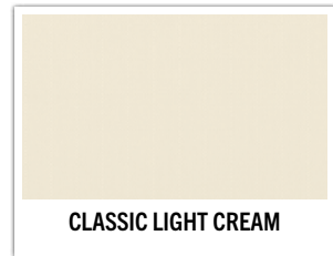
CLASSIC LIGHT CREAM

Nylite 90 / Maxilite 150 Against special order