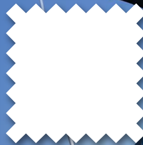
WHITE 3D371 X