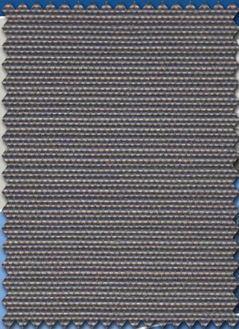
LIGHT CHARCOAL 3D334 X